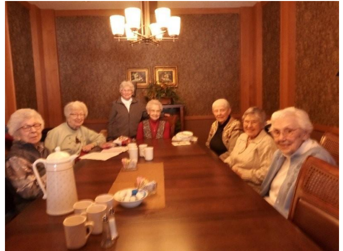
Nifty Nineties Group