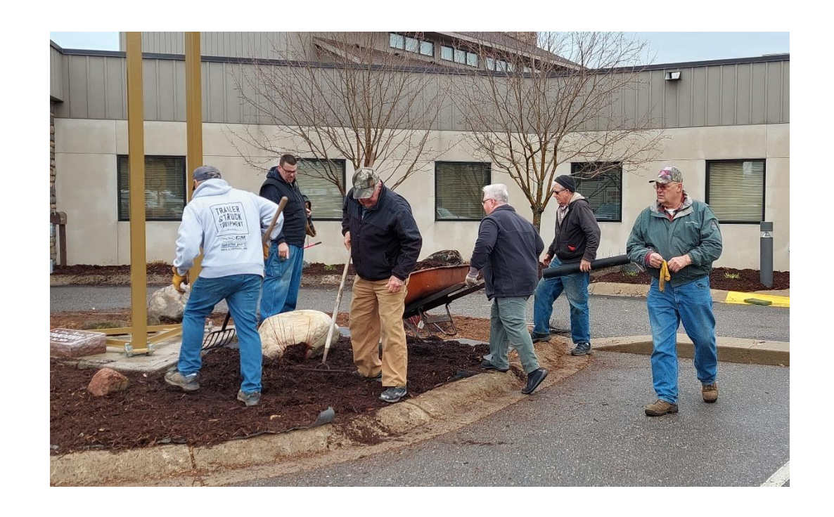
\leftarrow\leftarrow\leftarrow Who is this hooded raker??