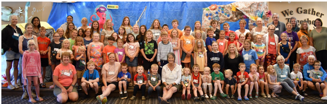
Pictured Above is the mighty crew from last year! We Hope You Join in on the Fun This Summer!

Whether you've helped before, or never been to VBS, you are welcome and encouraged to join in the fun this year!